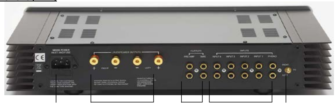
MAINS INPUT LOUDSPEAKER OUTPUT SIGNAL OUTPUTS SIGNAL INPUTS EARTH